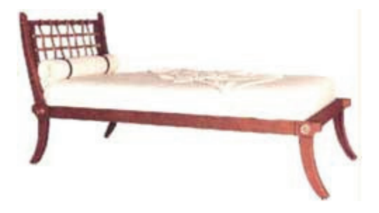
Figure 6: Greek kline