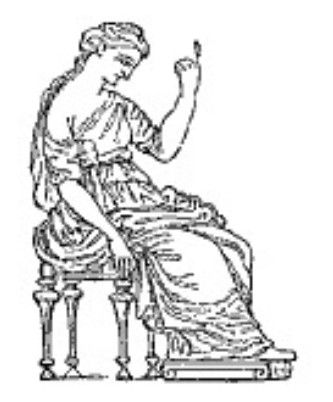
Figure 3: Sella